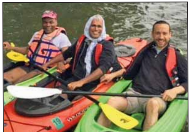
A day at the lake