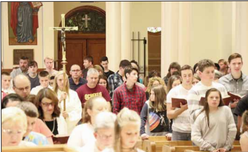
Opening Mass for the AFC Faith Formation programs, September 5, 2018